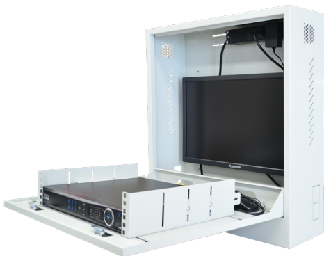
Compact Vertical Design