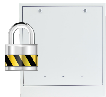
Dual Lockable Cabinet