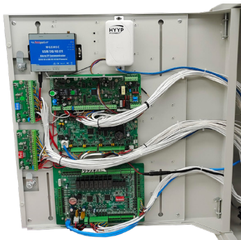
Capacity for Multiple Systems